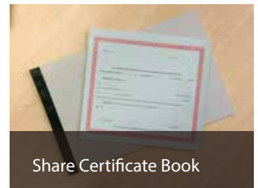
Share Certificate Book