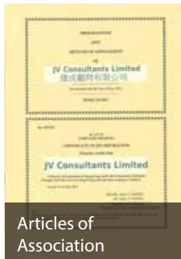
Articles of Association