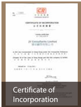
Certificate of Incorporation